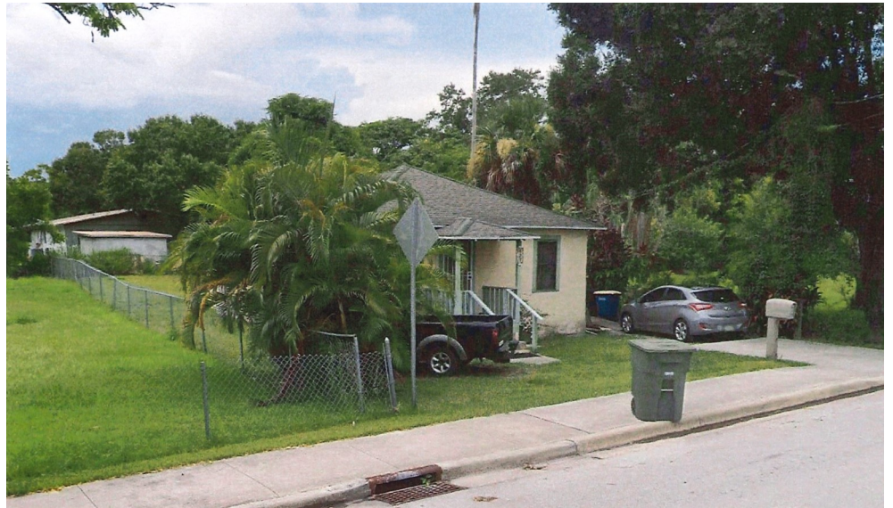
SUBJECT RESIDENCE - FRONT FACADE