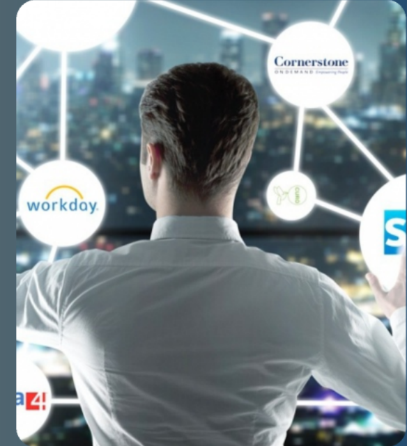
Learning Management Software

Require all employees who are interested in advancing into management to complete City leadership training.