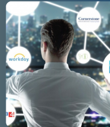
Learning Management Software

Require all employees who are interested in advancing into management to complete City leadership training.