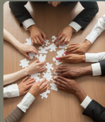
City Leadership Training

Require all departments to complete a Staff Assessment Tool for each potential successor.