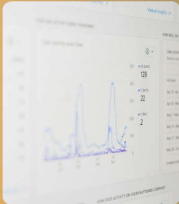
Key Position Inventory & Risk Assessment Report

Identify critical roles, hard to fill positions, and positions most at risk for retirement.