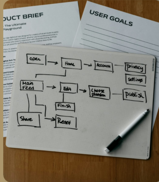
Staff Assessment Tool

Identify critical roles, hard to fill positions, and positions most at risk for retirement.