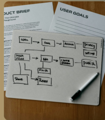
Staff Assessment Tool

Identify critical roles, hard to fill positions, and positions most at risk for retirement.