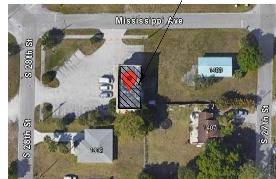
LOCATION MAP SCALE: N.T.S

TOTAL OCCUPANTS..... = 34 PERSONS ALLOWED (FBC) = 41 PERSONS ALLOWED (FFPC)