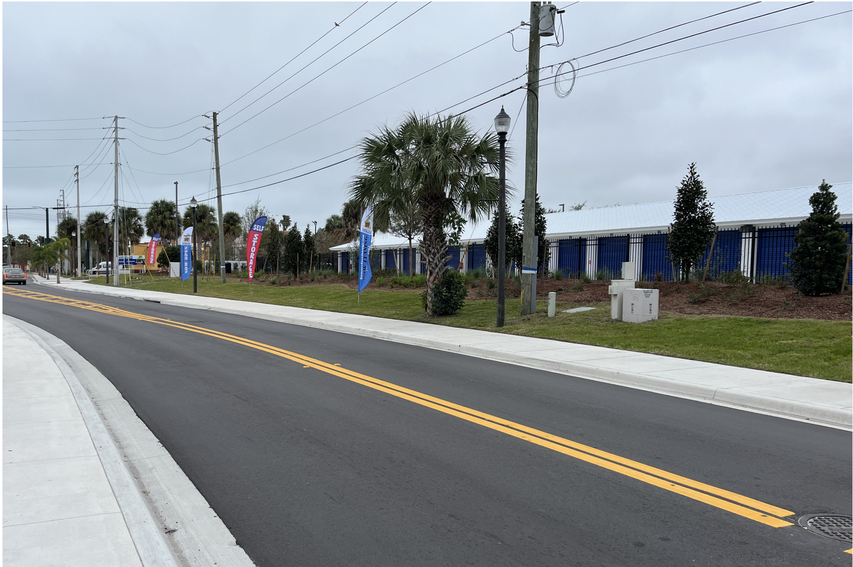
Ohio Avenue from 11th Street to US 1