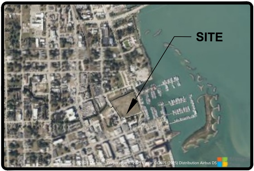
VICINITY MAP SCALE: 1:1,000