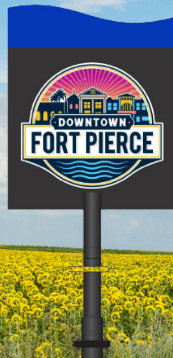
District Brand Sign