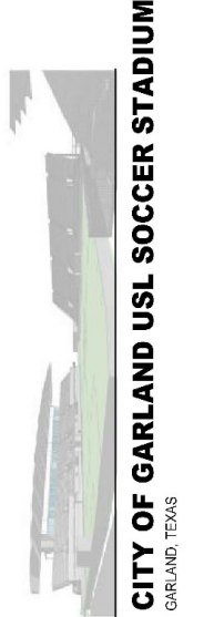
CITY OF GARLAND USL SOCCER STADIUM GARLAND, TEXAS