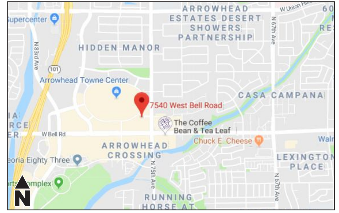
Vicinity Map - Scale: NTS