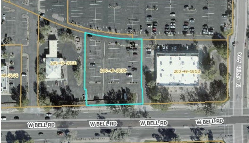
Exhibit A: Vicinity Map / Aerial Photograph

Dutch Brothers Coffee is proposed within the WINCO shopping center, located on the north side of Bell Road, east of 59th Avenue in the City of Glendale.