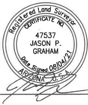
EXHIBIT "A" WELL SITE

A PART OF SOUTHWEST QUARTER, SECTION 30, T4N, R2E, GILA & SALT RIVER MERIDIAN, MARICOPA COUNTY, ARIZONA