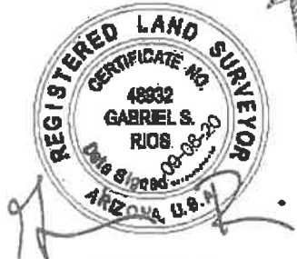
EXHIBIT "A" LOT 3 MINOR LAND DIVISION-LOT LINE ADJUSTMENT FOR THUNDERBIRD SCHOOL OF GLOBAL MANAGEMENT REVISED 9/8/2020 WP# 184814 PAGE 2 OF 2 NOT TO SCALE Z:\2018\184814\Survey\Legal\4814-L15R01.dwg