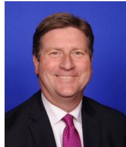
Rep. Greg Stanton (D) - District 4