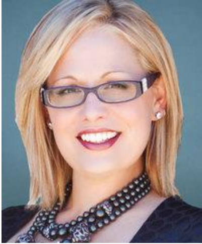
Senator Kyrsten Sinema (I) - Next Election in 2024