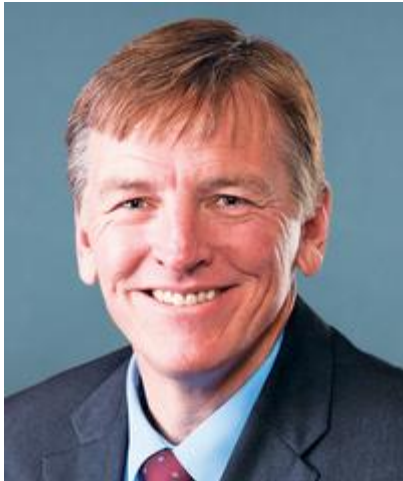
Rep. Paul Gosar (R) - District 9