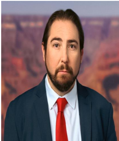
Rep. Eli Crane (R) – District 2