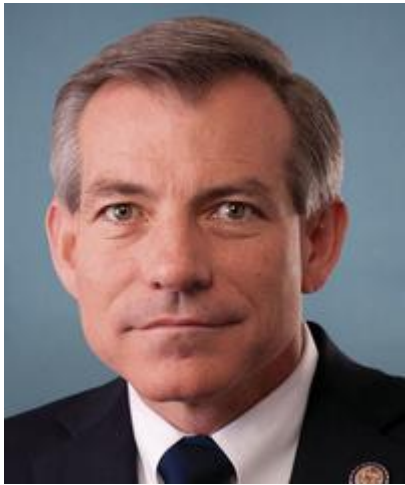
Rep. David Schweikert (R) – District 1