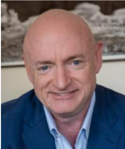
Senator Mark Kelly (D) - Next Election in 2028