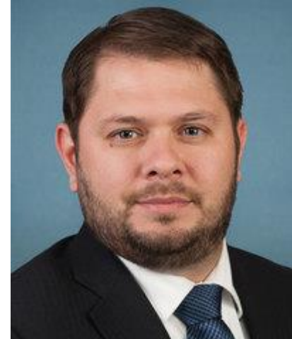
Rep. Ruben Gallego (D) - District 3