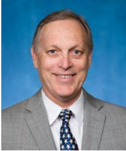
Rep. Andy Biggs (R) - District 5