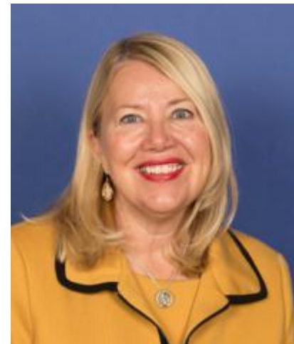
Rep. Debbie Lesko (R) - District 8