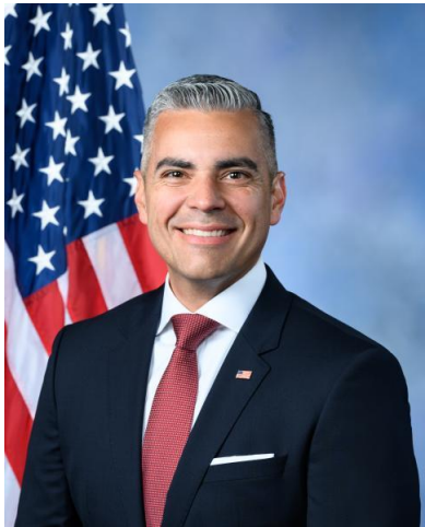
Rep. Juan Ciscomani (R) - District 6