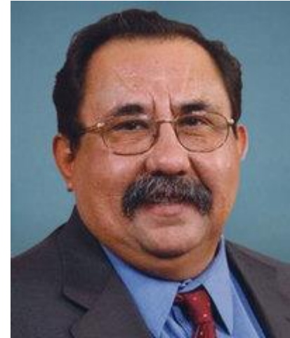
Rep. Raúl Grijalva (D) - District 7