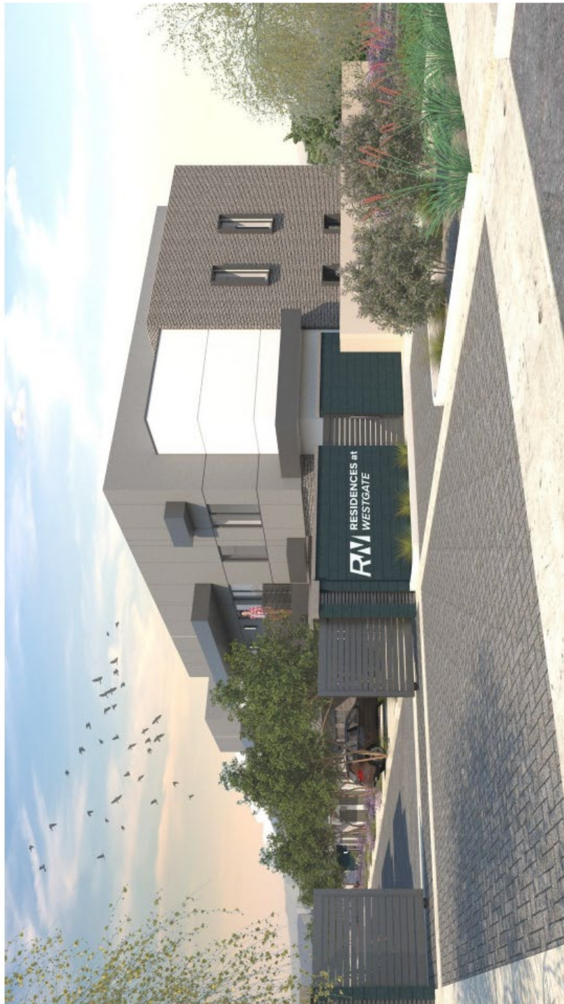
Representative example of entry rendering