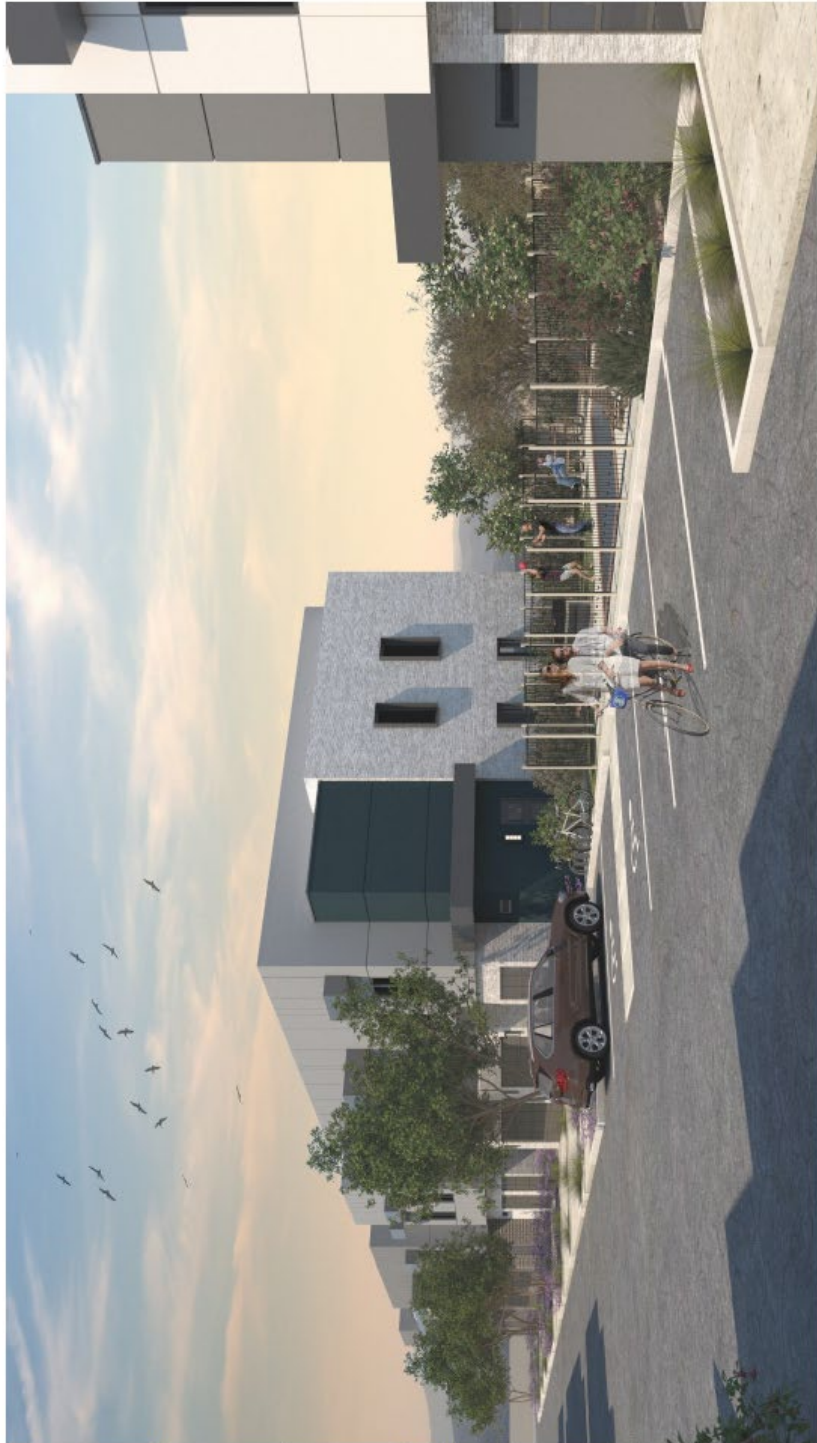
Representative example of pool area rendering