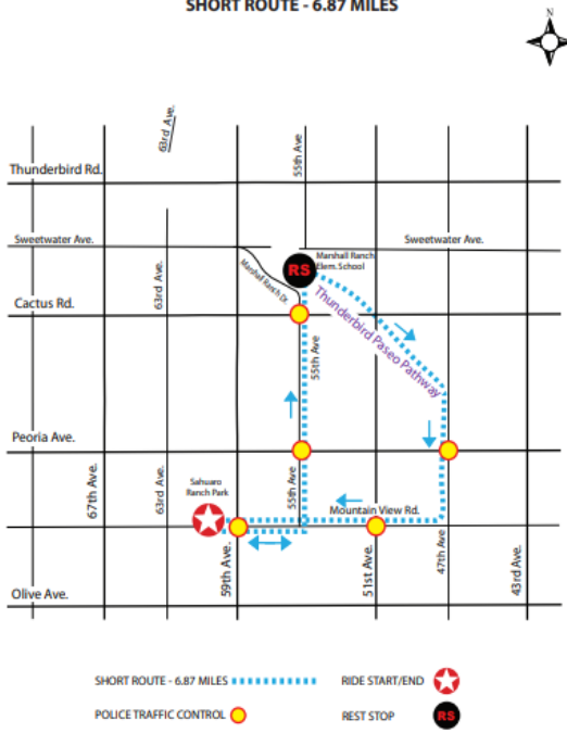
GLENDALE FAMILY BIKE RIDE SHORT ROUTE - 6.87 MILES