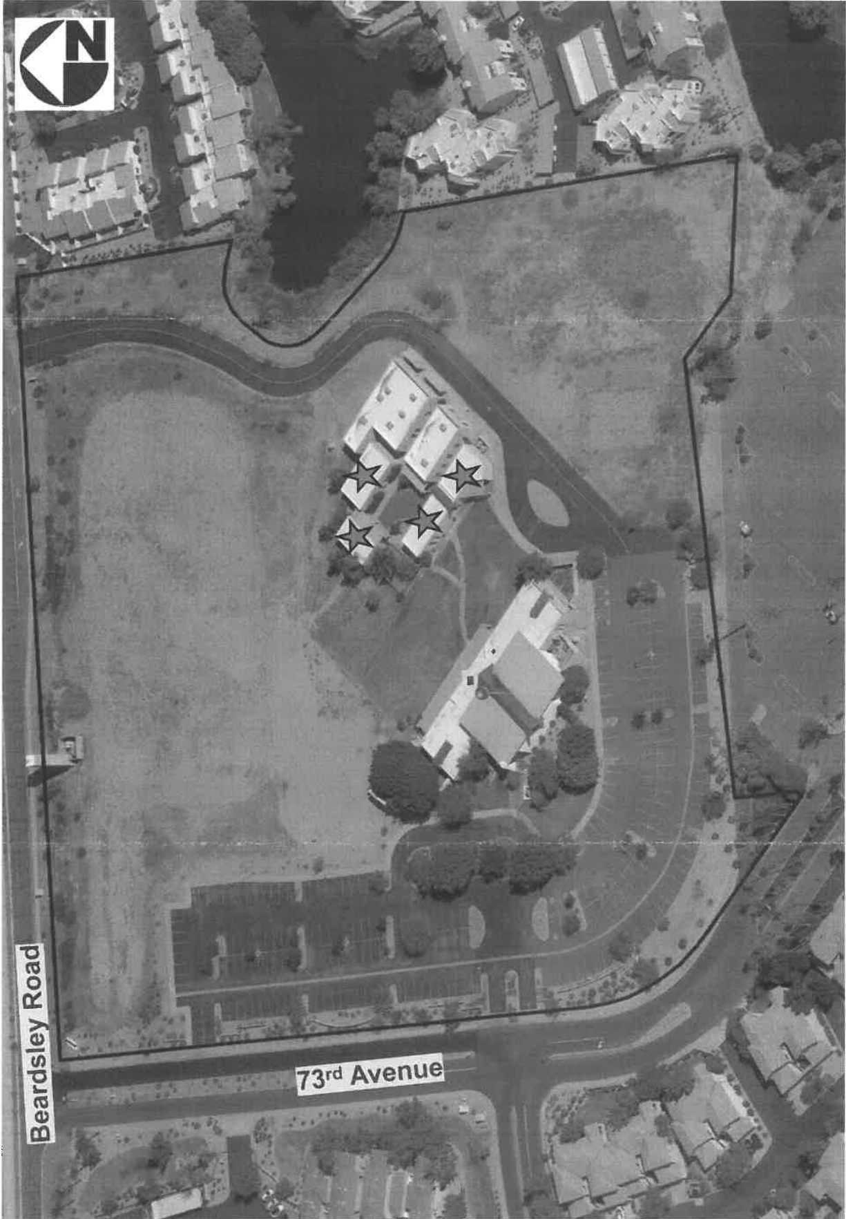
★ Proposed Sunrise Montessori School and childcare locations