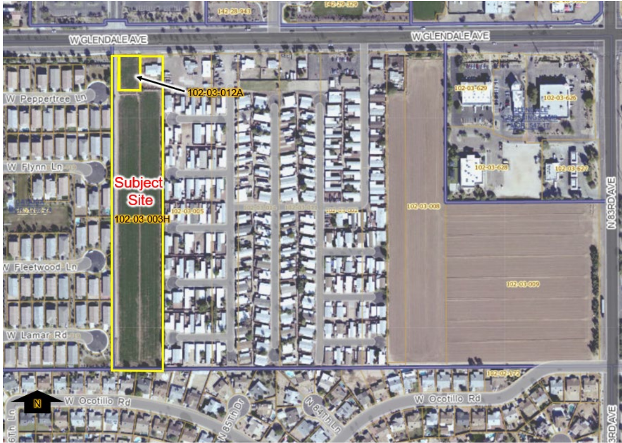
APNs: 102-03-003H and 102-03-012A