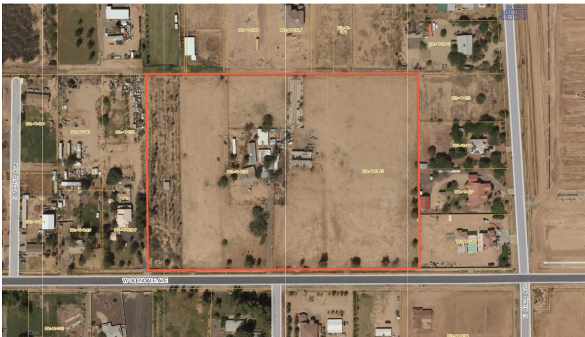
Figure 1 – Site Aerial

This is a request for annexation of the approximately 15.13 gross acre property located west of the NWC Glendale Avenue and Alsup Road, otherwise commonly known as Maricopa County Assessor's Parcel Number's 501-49-011E and -011D (cumulatively, the "Property") into the City of Glendale. The Property does not include the land at the immediate intersection which is owned by a separate owner. The Property is currently within Unincorporated Maricopa County. See Figure 1 , Site Aerial below: