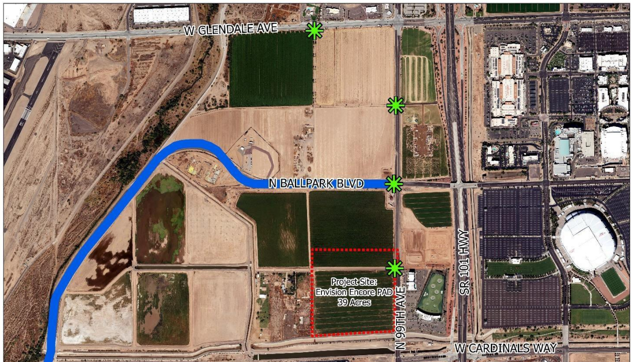
Conceptual Main Access Points