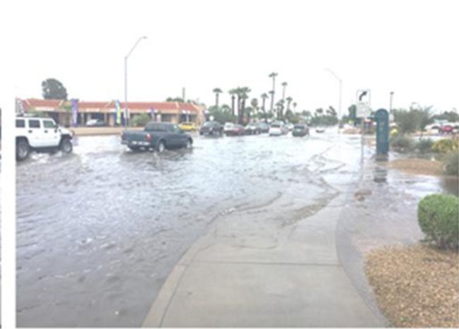
Bethany Home Road Looking East