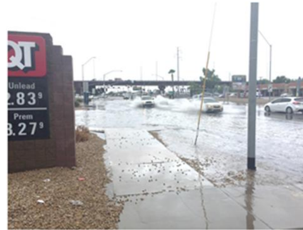
Bethany Home Road Looking West