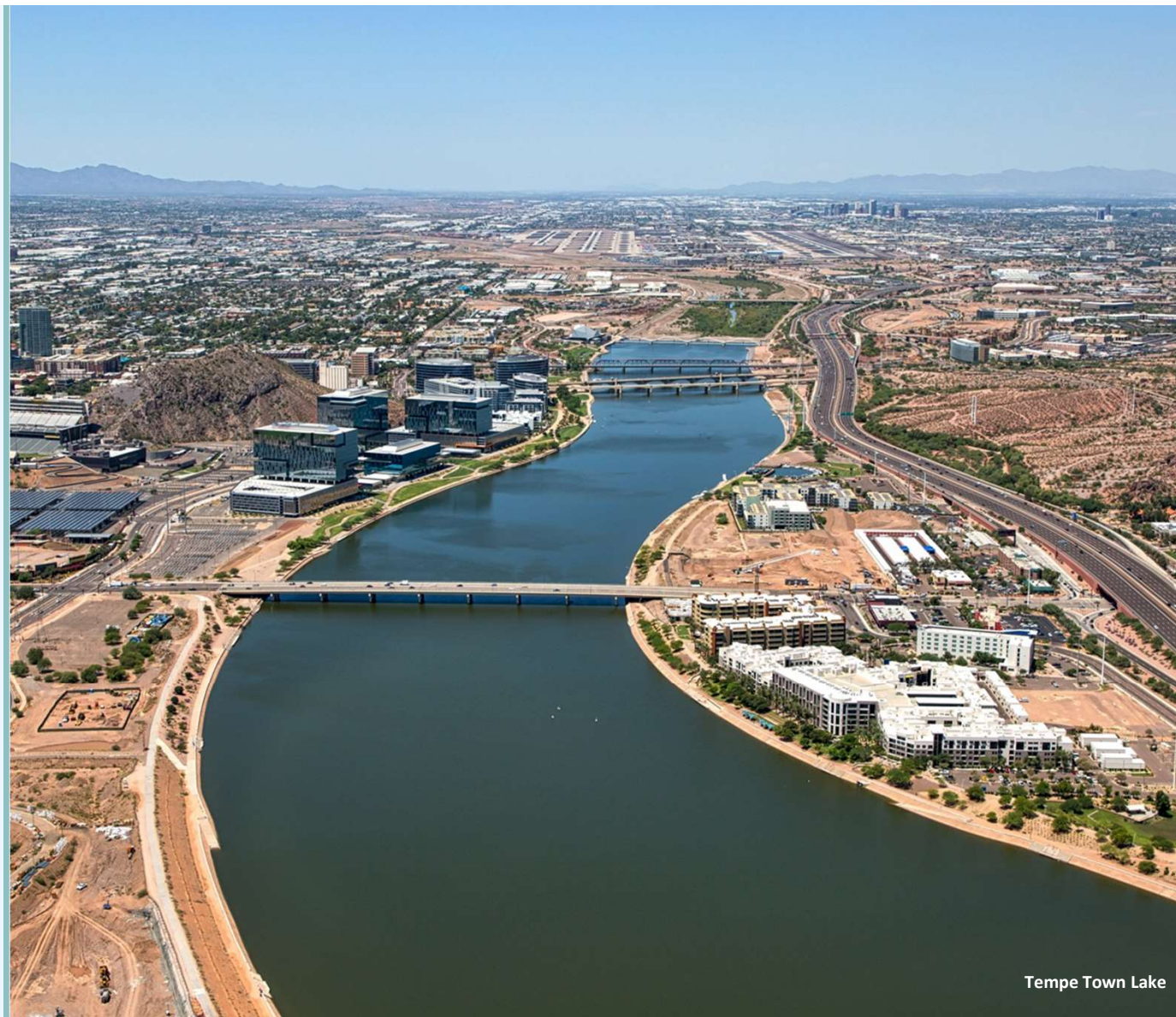
Tempe Town Lake