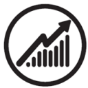
Fiscal Resource Management