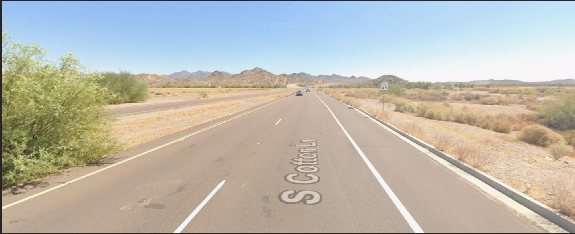
Scalloped Street - Two Lanes Reduced to Single Lane Southbound from Cotton Lane Bridge