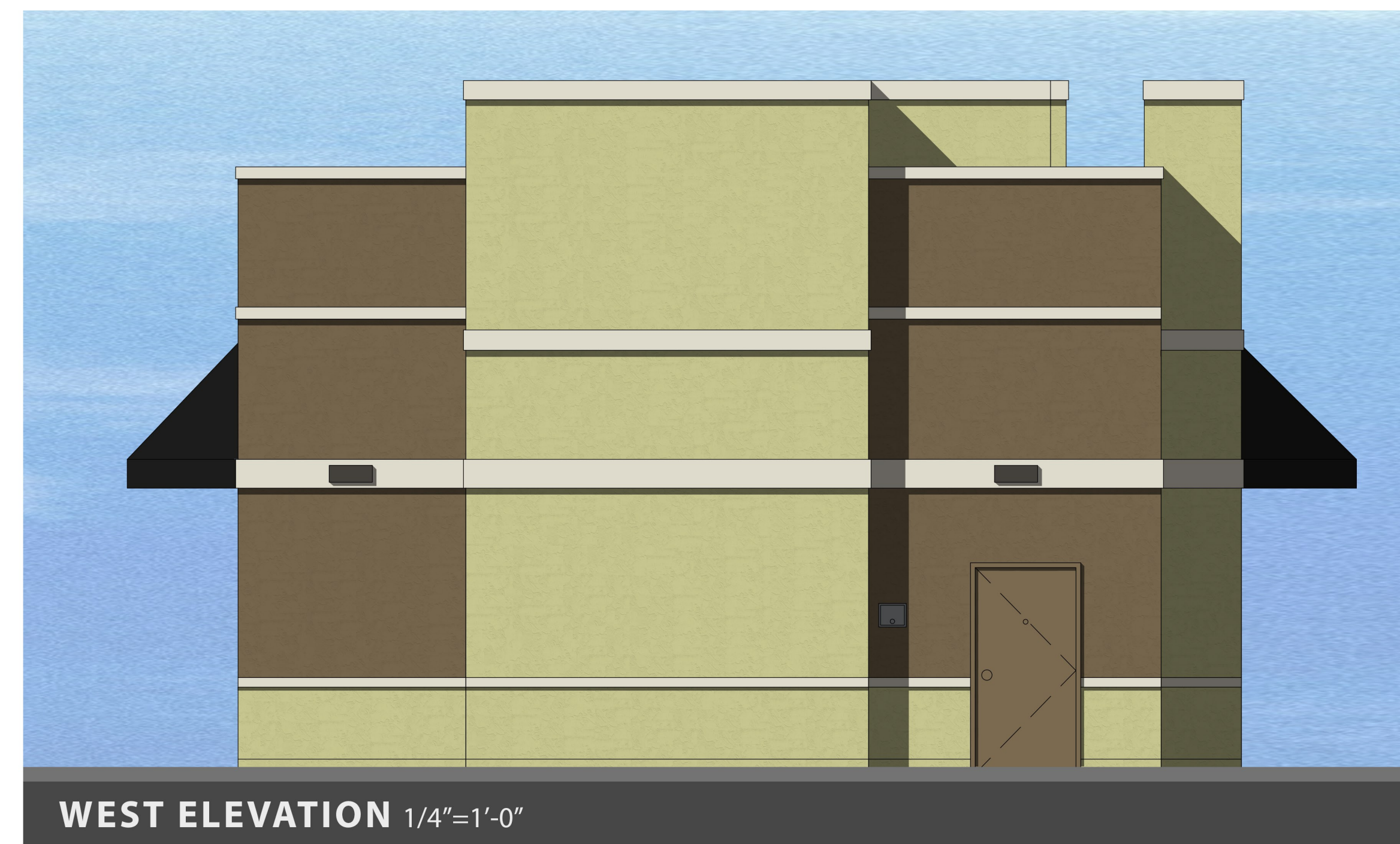
WEST ELEVATION 1/4"=1'-0"