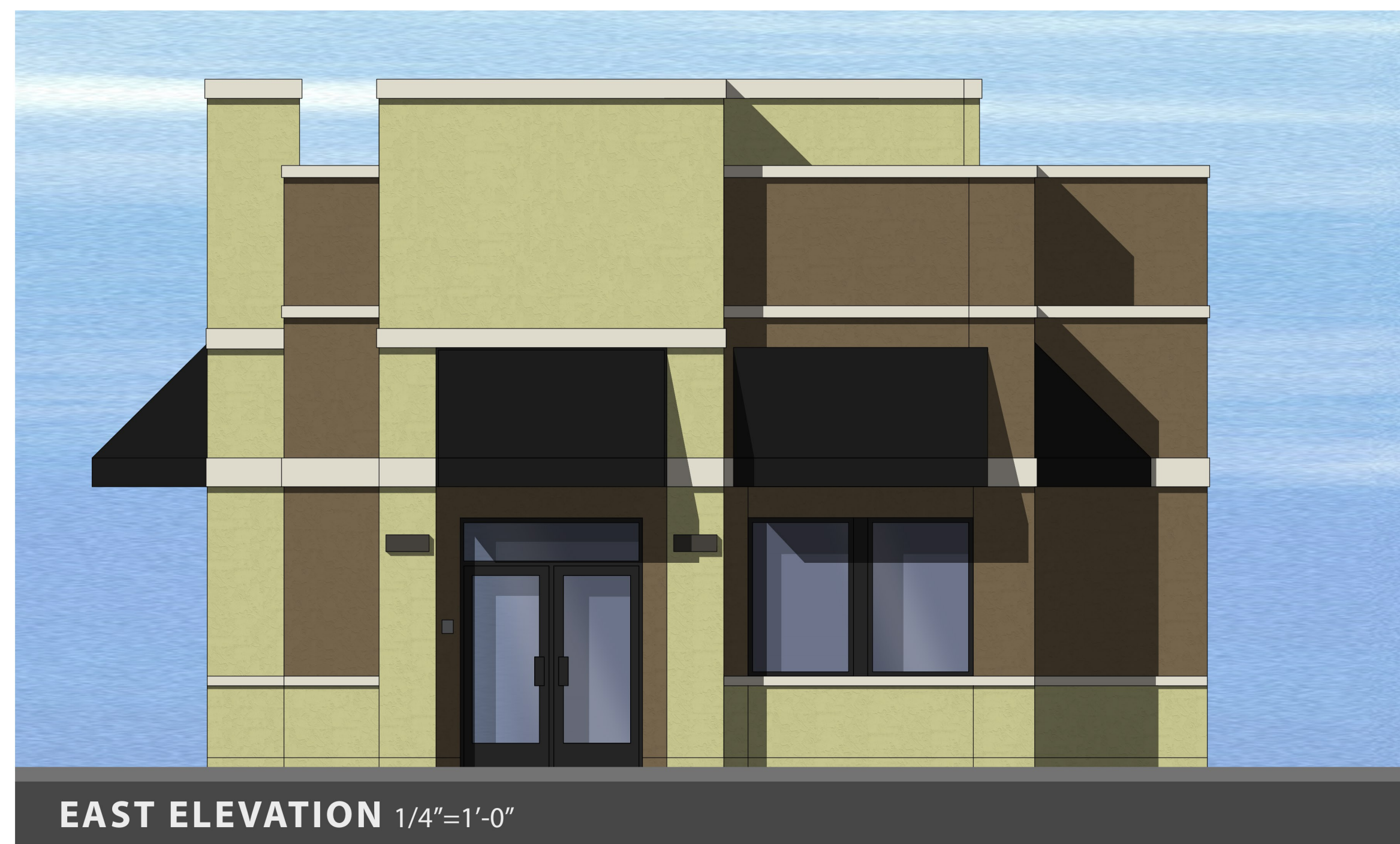
EAST ELEVATION 1/4"=1'-0"