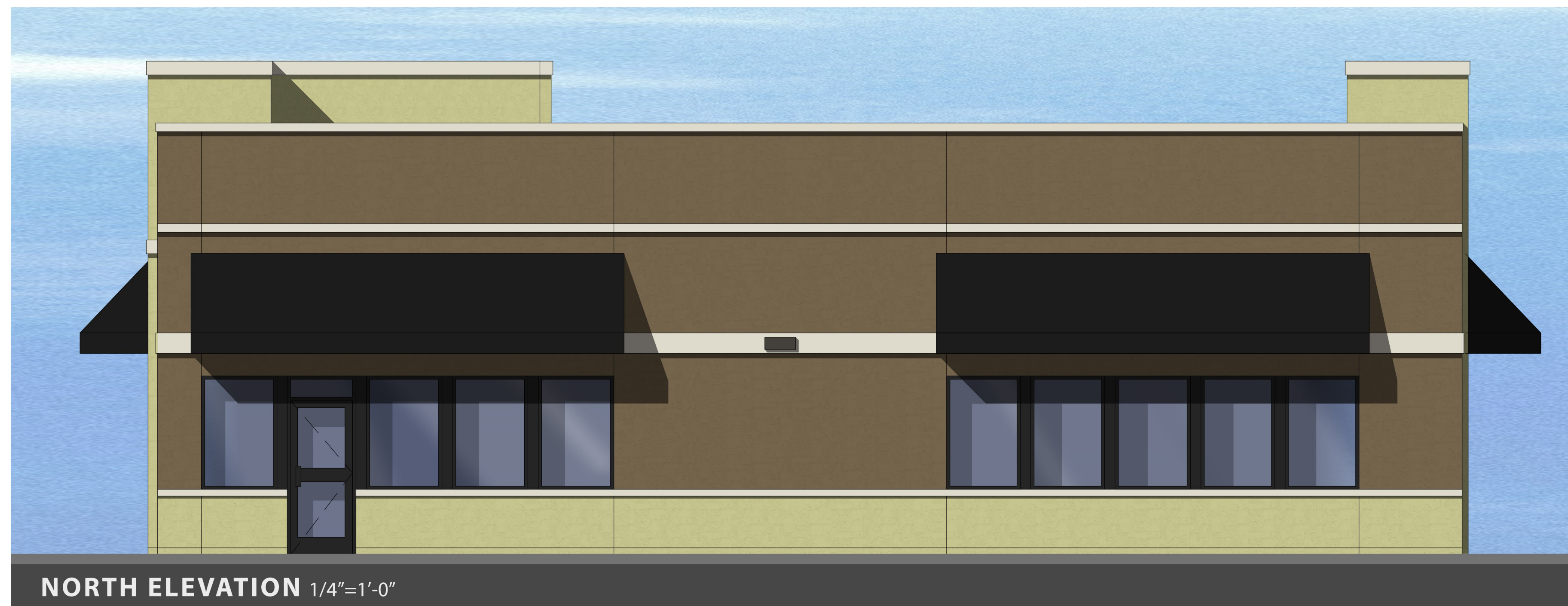
NORTH ELEVATION 1/4"=1'-0"