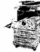
Printed for Display Only