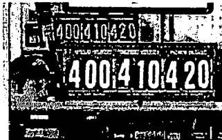
A gas customer is surrounded by over $4 prices as he fills up in Burlington, N.H.