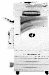
WorkCentre 7232 shown with the Two Tray option.