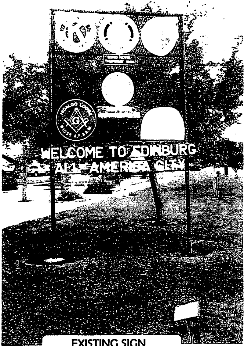
EXISTING SIGN CORNER OF BUS. US 281 (CLOSNER) & McINTYRE