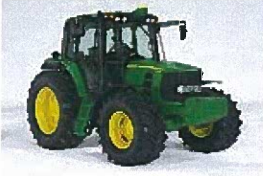
Illustration includes tires & other options not available on standard tractors.