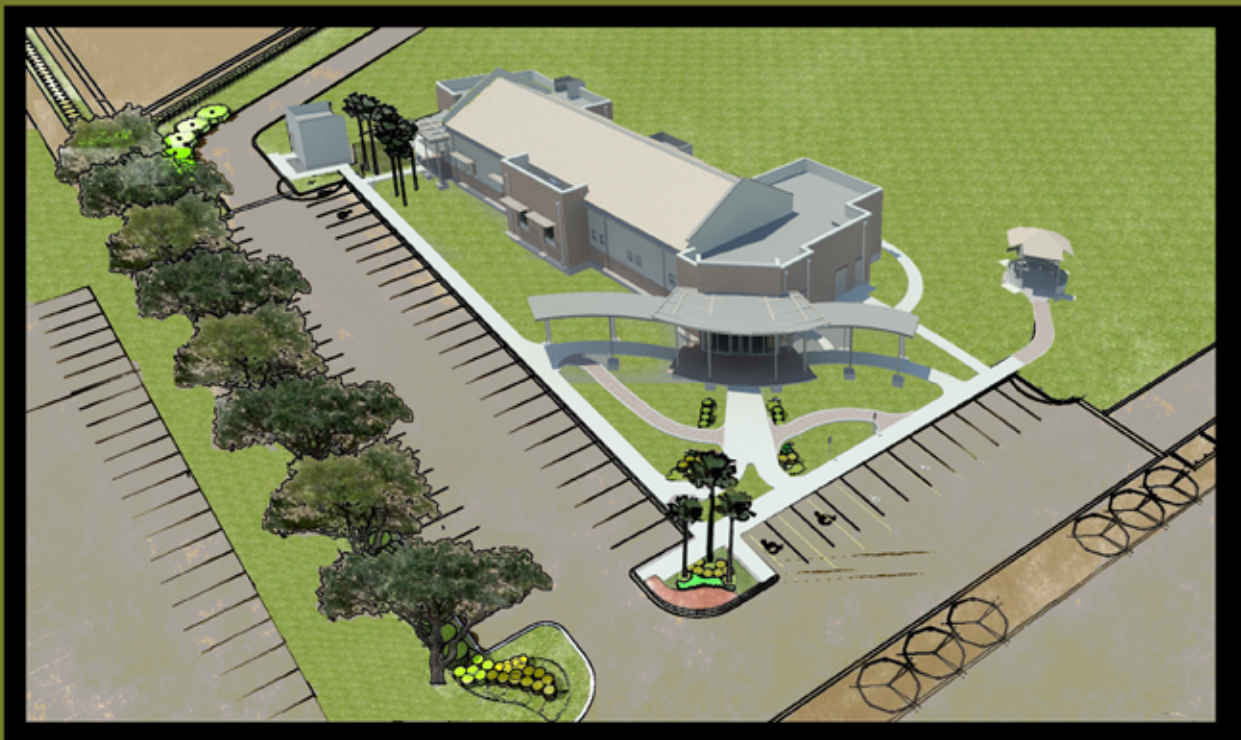
ARIEL SITE PLAN