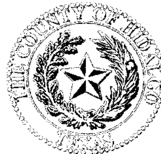
Noe Montez Hidalgo County Precinct 1