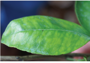
Fig. 3. Blotchy mottling and yellowing of leaves. This is a common symptom of CG and may appear initially on a single shoot or twig.