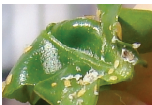
Fig. 2. ACP nymphs. In this stage, the insects measure 0.25mm–1.5mm in length and have a yellow-orange appearance. They feed on new growth (flush) and secrete a waxy substance.