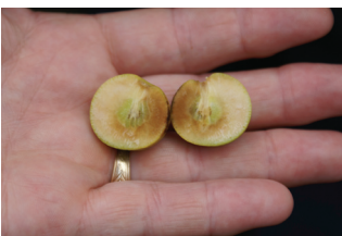
Fig. 9. Orange-brown discoloration of the internal flesh. This may appear inside the fruit on tissue where it attaches to the tree. The fruit tastes bitter and sour instead of sweet.