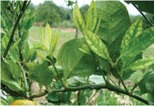
Fig. 4. Bunched, narrow leaves, commonly referred to as "rabbit ears." Small and narrow yellowed and/or mottled leaves grow in a tight arrangement, resulting in a bunchy appearance.