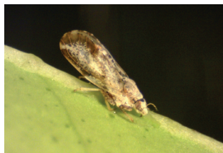
Fig. 1. Asian citrus psyllid (ACP), Diaphorina citri (Kuwayama). This insect is a vector of the bacterium that causes CG. ACPs are small, measuring approximately 3mm in length. Their bodies are lifted in a 45-degree angle due to the shape of their heads.