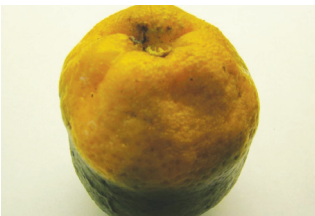
Fig. 7. Mature fruit appearance. The fruit may appear lopsided or asymmetrical.