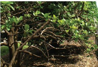
Fig. 5. Twig and branch die-back. Infected trees may have leafless twigs and/or branches. Trees appear unhealthy because this portion of the tree may be dead.