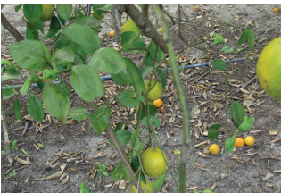
Fig. 8. Premature fruit drop. CG can cause higher than normal fruit drop.