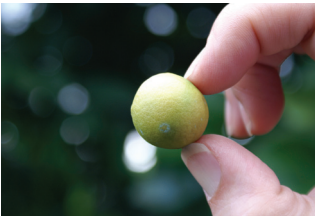
Fig. 6. Reduced fruit size. The fruit is stunted and does not continue to enlarge; it remains green to partially green in color.