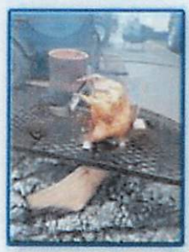
Sanctioned by IBCA