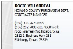
image001.jpg 12 KB