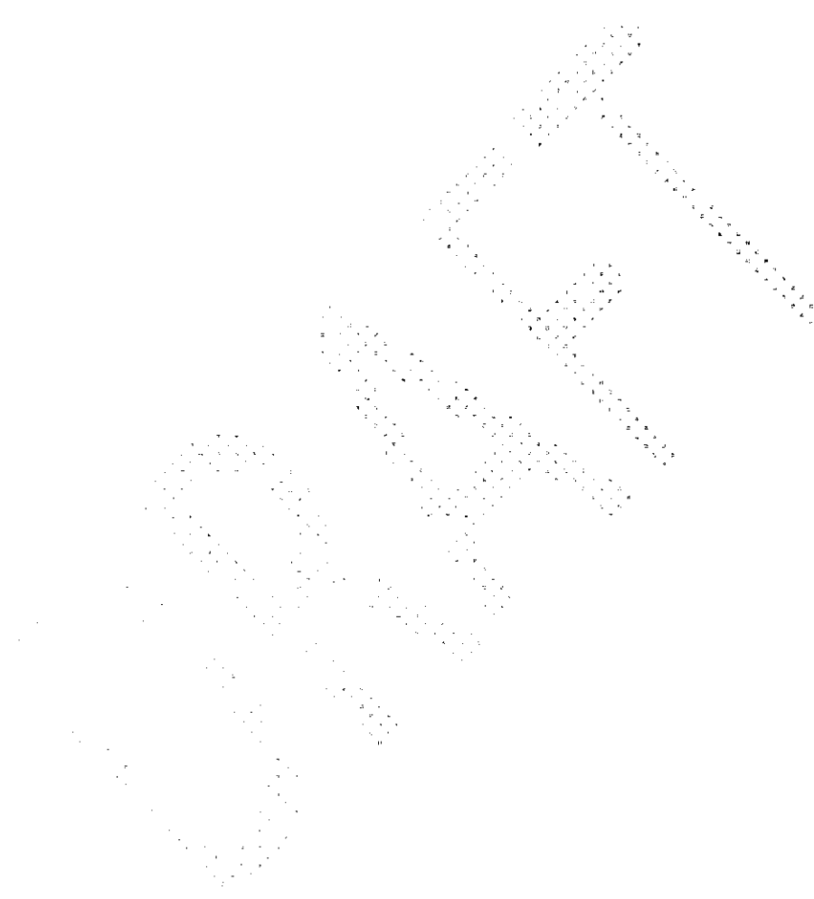
EXHIBIT "A" REQUEST FOR SEALED QUOTES (RFSQ) PROCUREMENT PACKET