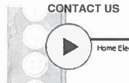
Optimised Analytical Repository