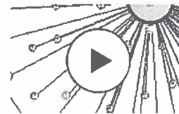
Powerful Visual Analysis