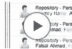
Data Management and Discovery