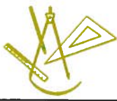
EXHIBIT "D" CONTRACT RATES