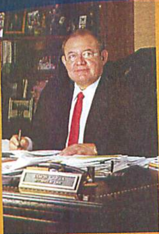
COUNTY JUDGE RAMON GARCIA

N estled deep in the heart of South Texas and known to be one of the fastest growing areas in the nation, Hidalgo County is the eighth most populous county in the State of Texas and home to close to 800,000 people.