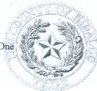
A.C. Cuellar, Jr. Hidalgo County Commissioner Precinct One