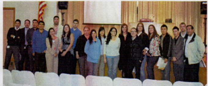
UTPA Criminal Justice Department