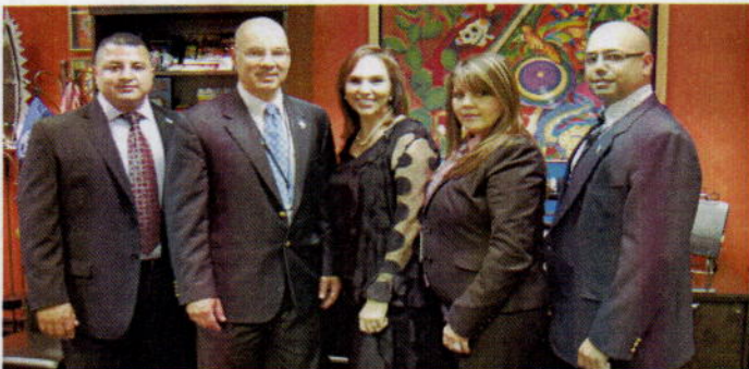
Hidalgo County District Clerk's 5th Annual Open House