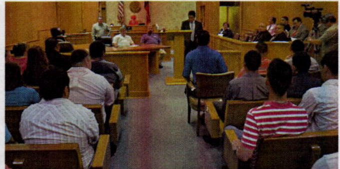
Drug Court Graduation