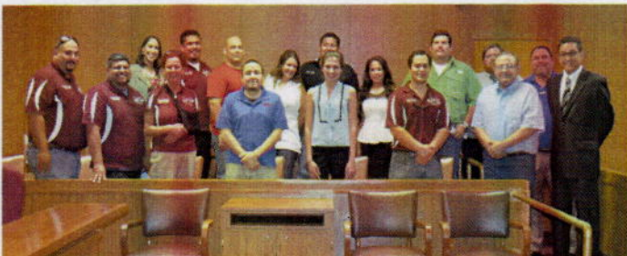
Hidalgo County Hosts Leadership Mission