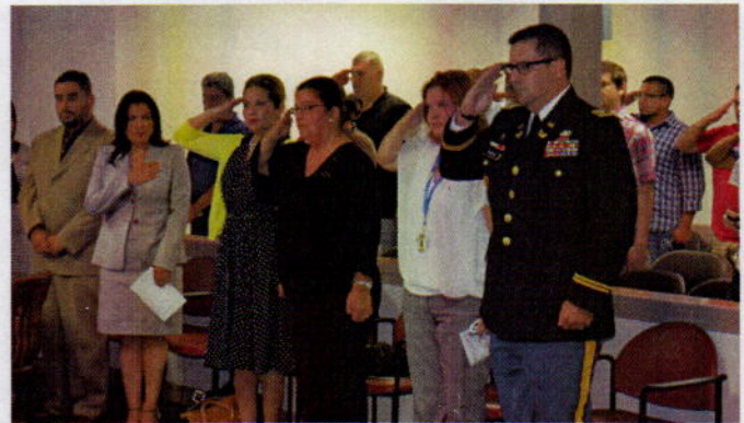
Veterans Treatment Court Program Graduation