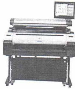
Pictured setting on top of wide format printer. Not included