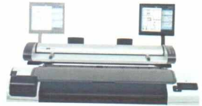
Cortex MFP Repro provides a good ergonomic environment for left- as well as right-handed operation.