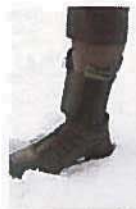
Atlas Gen II Tactical First Aid Ankle Kit Our Price: $34.95