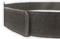
Atlas Liner Belt Our Price: $19.95