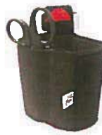
Atlas Gen I Tactical First Aid Ankle Kit Our Price: $34.95