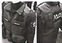
Safariland Oregon City Armor Carrier Base Price $194.95