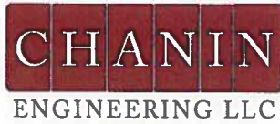
EXHIBIT B -Scope of Services to be Provided by the Engineer