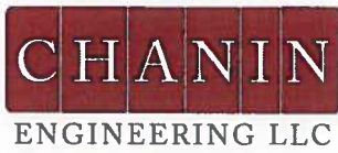
EXHIBIT D – Engineer's Contract Rate

Chanin Engineering, LLC's prevailing rates are as follows: