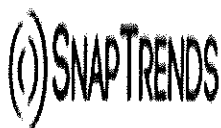
image001.png 4 KB