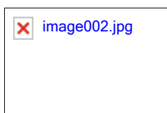
image002.jpg 4 KB