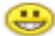
image001.gif 345 B