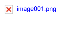
image001.png 13 KB