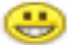
image001.gif 345 B