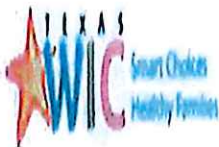
image001.jpg 3 KB