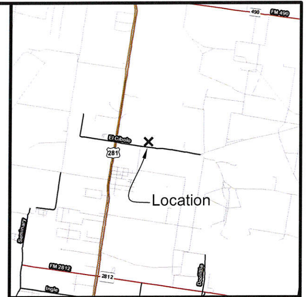
LOCATION MAP SCALE 1"=4000'