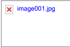
image001.jpg 5 KB